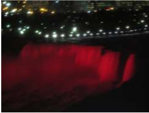
Niagara Falls lit orange for Color The World Orange™ 2016