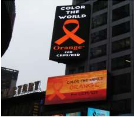
Billboards in Times Square New York for Color The World Orange™ 2017