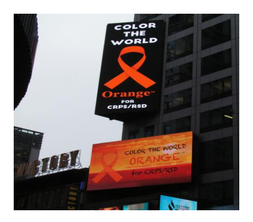
Billboards in Times Square New York for Color The World Orange™ 2017