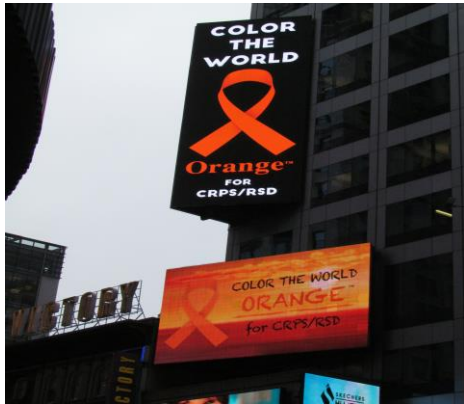
Billboards in Times Square in New York for Color The World Orange™ 2017