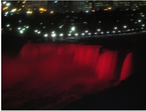
Niagara Falls lit orange for Color The World Orange™ 2016